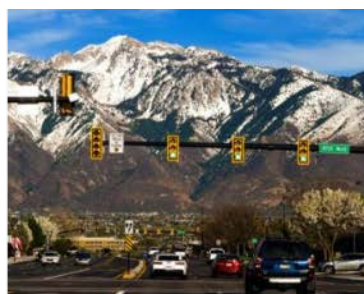
Traffic Signal Management