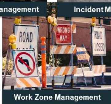
Work Zone Management