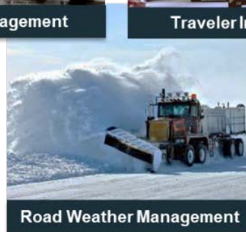
Road Weather Management